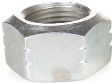
Old Part Number: 1140

The 1140X is a reliable off-the-shelf alternative to the 1140 custom lock nut. We've made this change to resolve a concern where the threads on the piston rod of 45020 PV and 20020 SC glycol pumps have been damaged during routine maintenance.