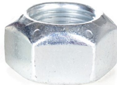
New Part Number: 1140X

Will remain in Repair Kits until 4/1/2021 Requires 1-1/4" Socket